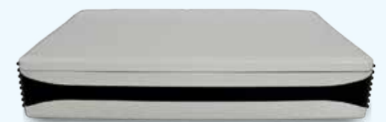
TC-1 AUTOMATION PROCESSOR